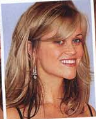
The side view!

Blond highlights rough up the cuticles, which makes fine hair like Reese Witherspoon's look fuller.