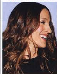
The side view!

Blond highlights rough up the cuticles, which makes fine hair like Reese Witherspoon's look fuller.