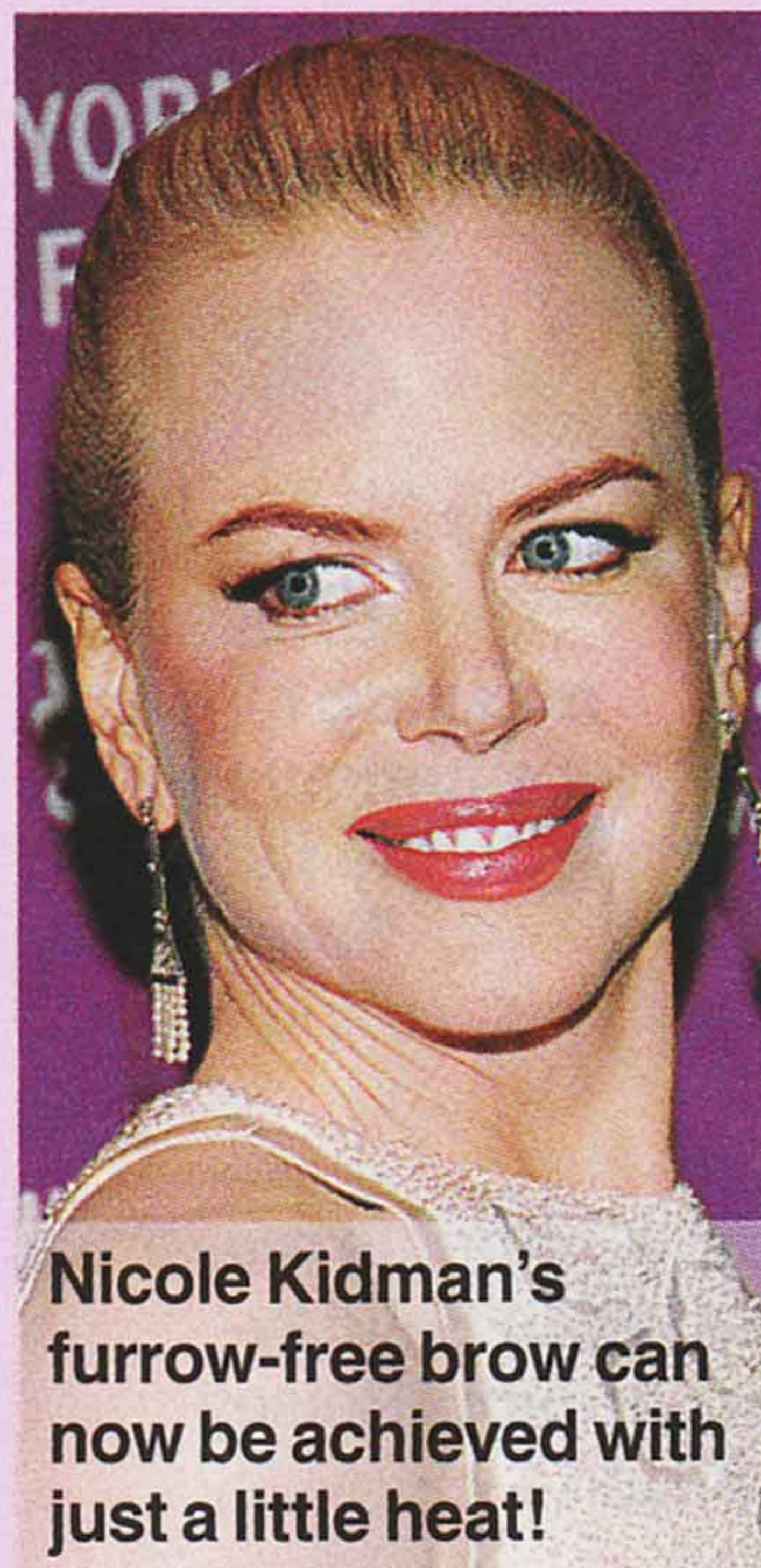
Nicole Kidman's furrow-free brow can now be achieved with just a little heat!

A chemical-free way to freeze frown lines? Indeed! Now stars can opt for a longer-lasting treatment that, as NYC cosmetic dermatologist Dr. Cameron Rokhsar explains, involves inserting two tiny needles into the area between the brows to transfer radio-frequency waves. The heat generated incapacitates the targeted nerves on both sides of the inner brows, decreasing function without immobilizing the entire area. The upside to the $2,000 treatment? While pricier than Botox, the effects can last up to two years. The downside? The effects can last up to two years — like it or not!