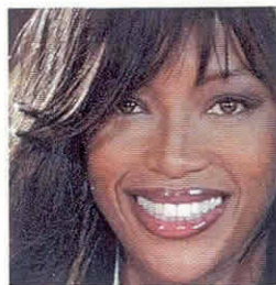
Cindy Crawford Naomi Campbell

The New York/New Jersey Centers of Cosmetic & Restorative Dentistry New York, NY Bayonne, NJ 1-877-50-SMILE